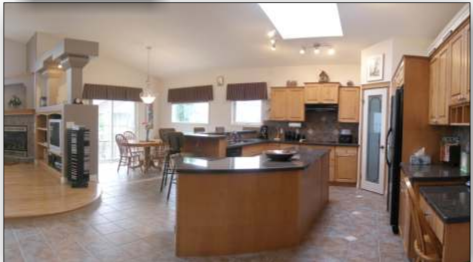
Spacious Gourmet Kitchen

Spacious and elegant with soaring cathedral ceilings, and floor to ceiling windows this room boasts: