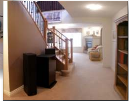
Spacious 4th & 5th Bedrooms