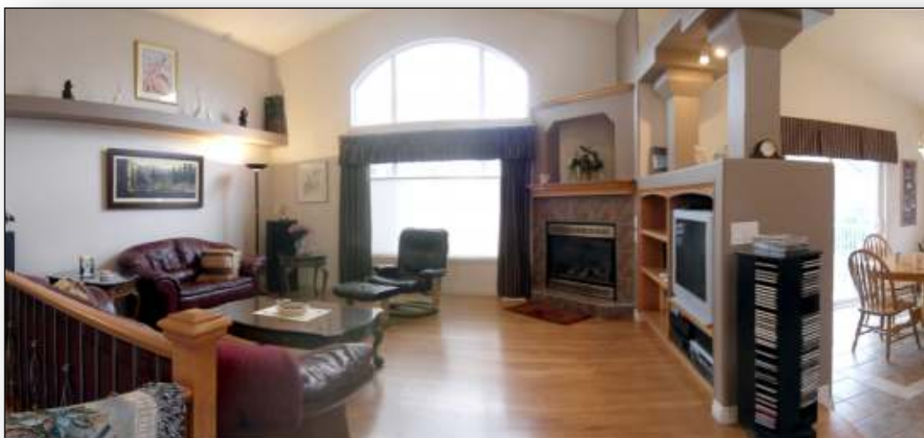
Warm and Inviting Great Room