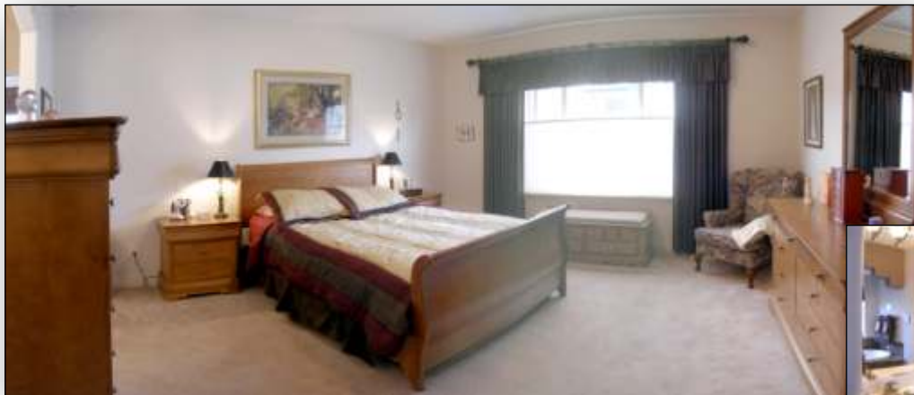
Master Bedroom & Ensuite

Full four piece bath discreetly located near back entrance. Maple cabinets, easy care ceramic tile floors and stylish pewter trim.